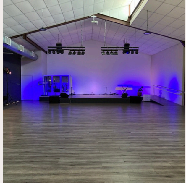
Auditorium view from rear of hall. Large shed door accommodates bump-in of large features.