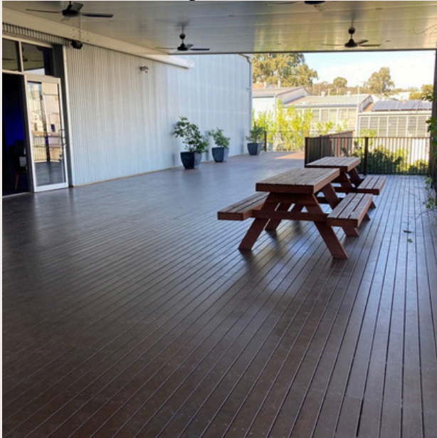
Undercover deck with lights and fans.