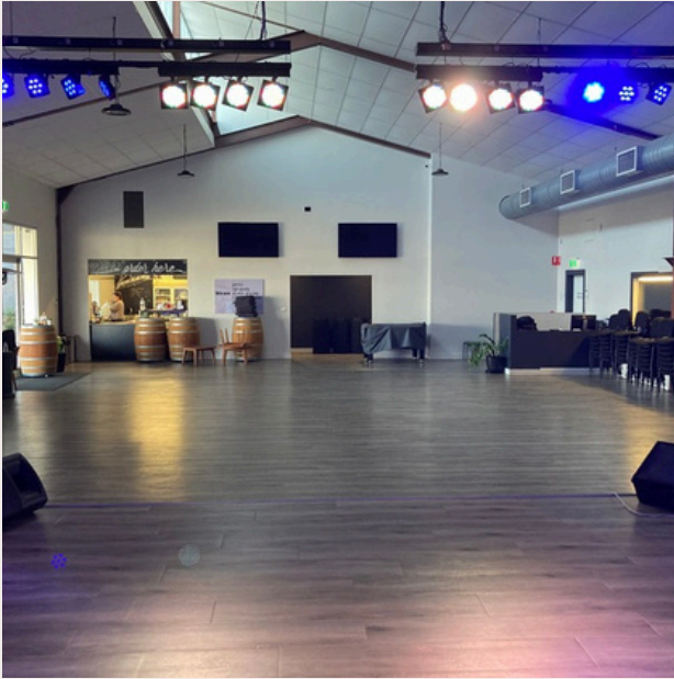
Auditorium view from stage. Wine barrels and other deck furniture pictured at rear.