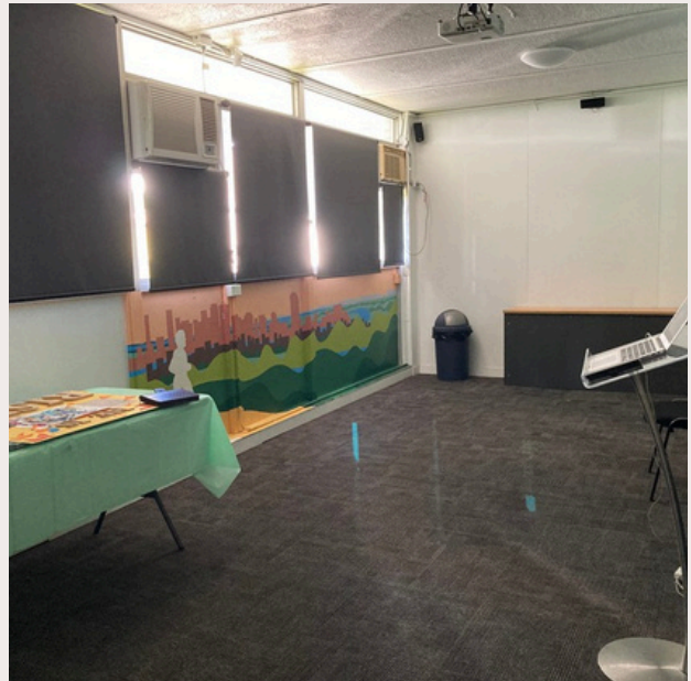
Large room with projector, customisable for desired activities. Carpeted floor.