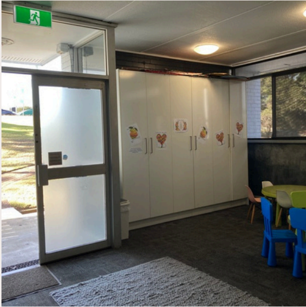
Private entry into activity room one.