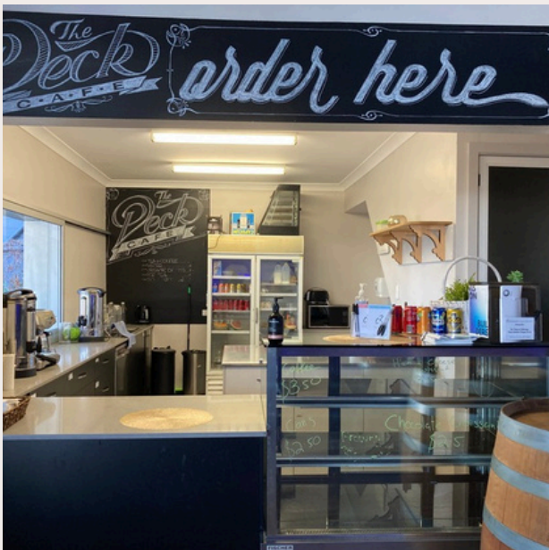
Kitchen equipped with appliances, display fridge, oven and stovetop.