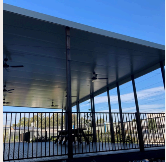
Deck view from carpark entry walking ramp.