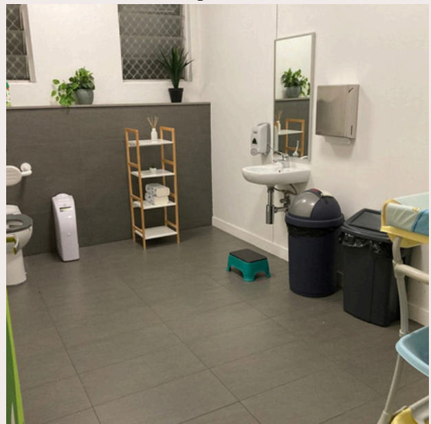
Disabled bathroom with baby change facilities.