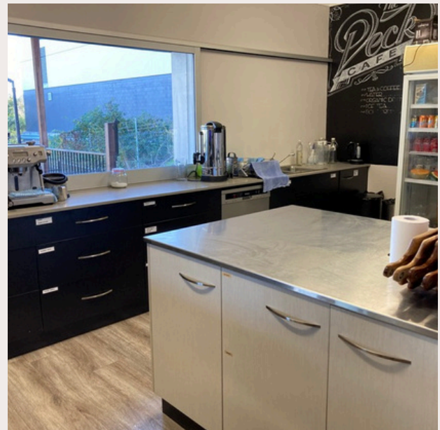
Kitchen servery window opens to deck. Stainless steel bench, dishwasher.