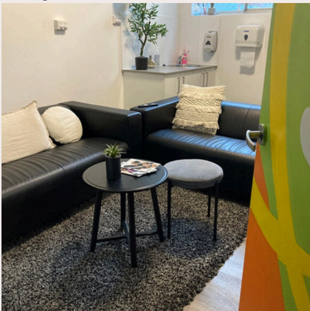
Activity room three with sink.