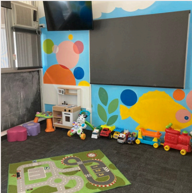
Toy room adjacent to activity room one. Ideal waiting room facilities for families.