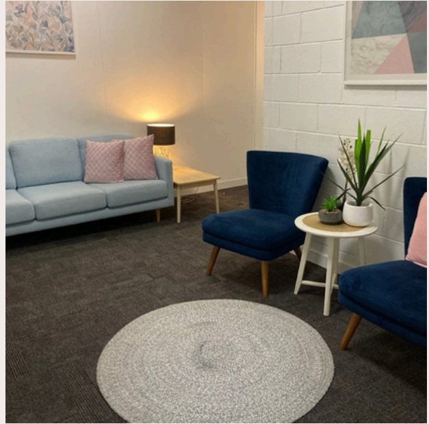
Activity or meeting room two.