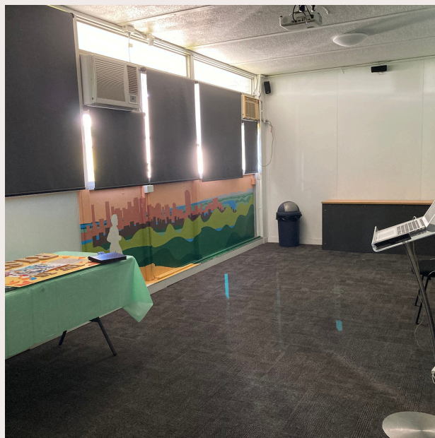
Large room with projector, customisable for desired activities. Carpeted floor.