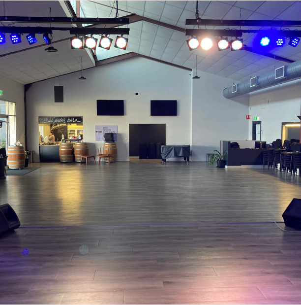
Auditorium view from stage. Wine barrels and other deck furniture pictured at rear.