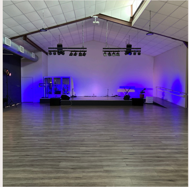
Auditorium view from rear of hall. Large shed door accommodates bump-in of large features.