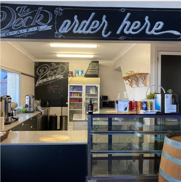
Kitchen equipped with appliances, display fridge, oven and stovetop.