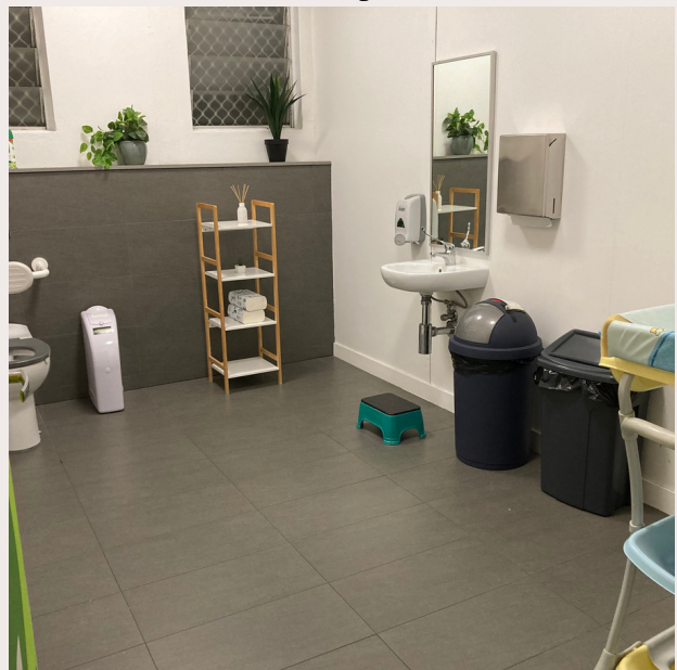
Disabled bathroom with baby change facilities.