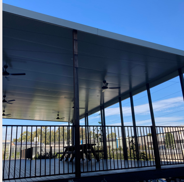
Deck view from carpark entry walking ramp.