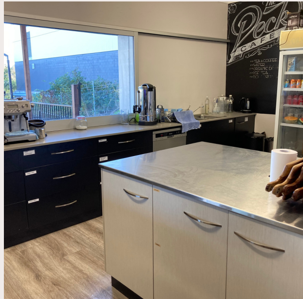
Kitchen servery window opens to deck. Stainless steel bench, dishwasher.