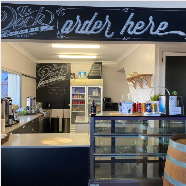
Kitchen fully equipped with appliances, display fridges, oven, stovetop, freezer and crockery.