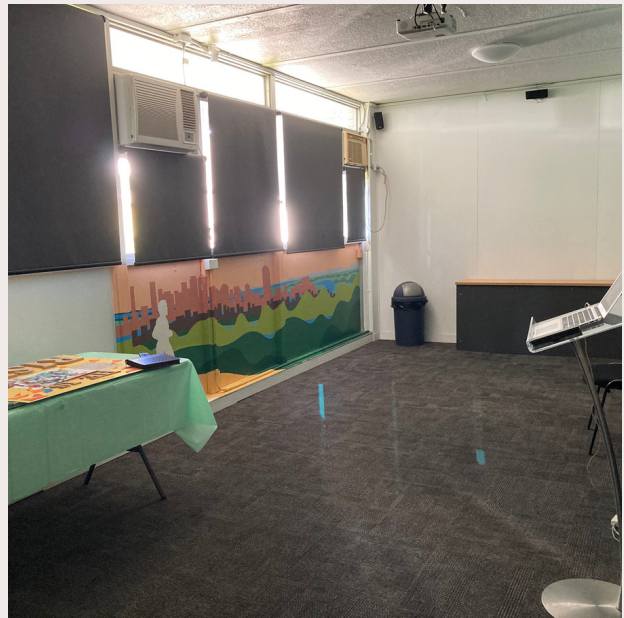
Large room with projector, fully customisable for desired activities. Carpeted floor.